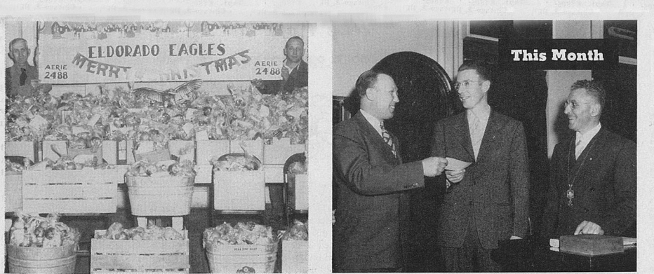
CHRISTMAS BASKETS will be filled with holiday goodies and distributed to the needy in many communities by charitable Eagles. MEMBERSHIP PRODUCERS come into their own in December as most Aeries pay them tribute by initiating classes in their honor.