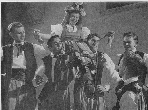
FOLKS FROM MANY LANDS are included on all Eagle rosters. Programs and nationality groups are on the entertainment schedules of many Aeries.