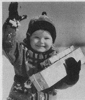
TINY TOTS will get a preview of Christmas at Eagle-sponsored Yuletide parties.

Basketball makes its bid for sports attention in December. Many Aeries will sponsor cage teams in local leagues; others will organize leagues for members; still others will see to it that Eagle sons and the youngsters of the community get their chance to play the game.