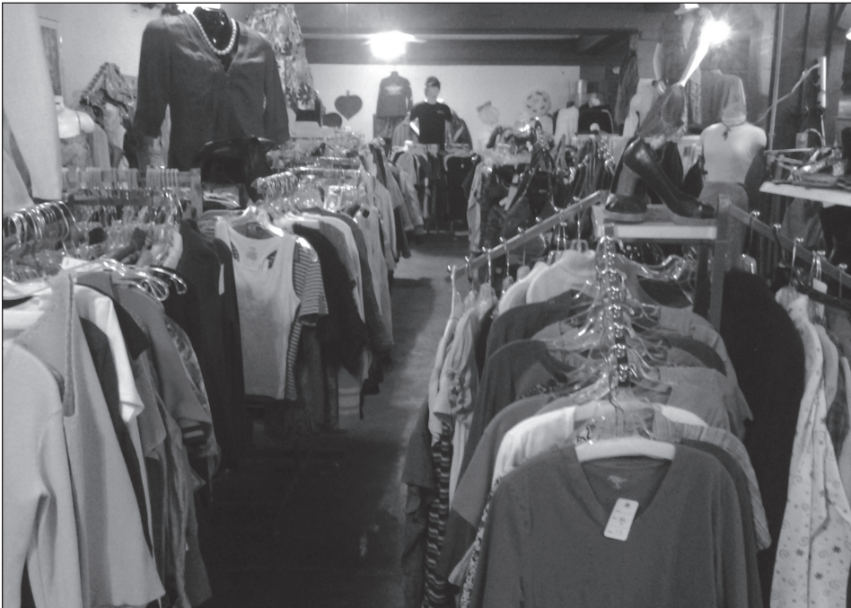
Racks of gently used clothing items fill E-Mart thrift store, located in the basement of Olympia Eagles #21. The store has raised thousands of dollars for charity in just 18 months.

THE OFFICIAL BULLETIN OF THE FRATERNAL ORDER OF EAGLES GRAND AERIE