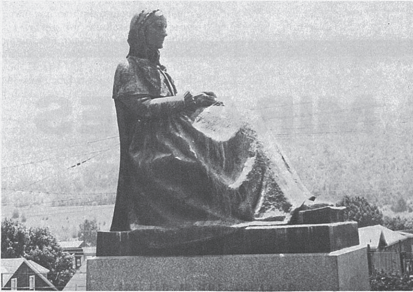
Whistler's famous painting of his mother was the inspiration for this bronze sculpture in Ashland, Pa., a tribute to all mothers everywhere