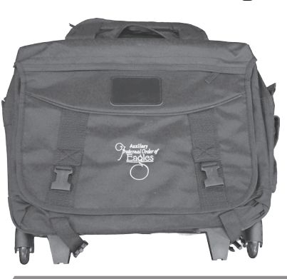
Business Roller Bag