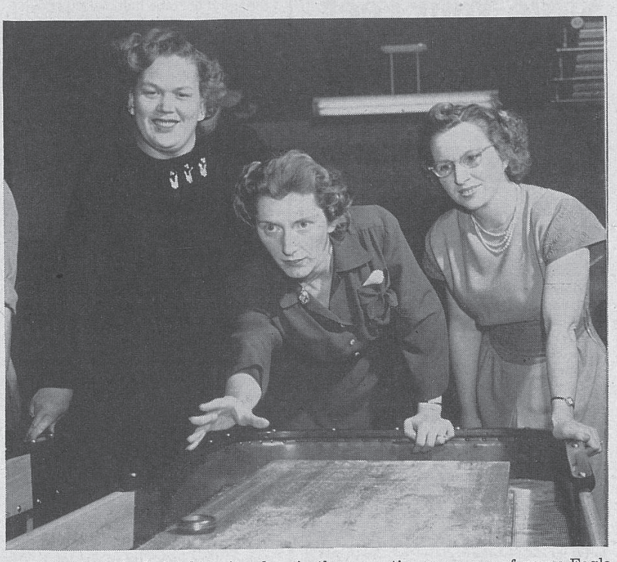
SHUFFLEBOARD is fast taking its place in the recreation programs of many Eagle Aeries. Both men and women enjoy playing the game on a league or "open" basis.