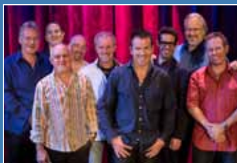
Blood, Sweat & Tears

Guests of this year's Mr. & Mrs. Banquet will be treated to the soulful stylings of legendary music group Blood, Sweat & Tears. Since late